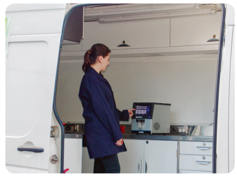
Mobile Lab is enclosed climate controlled lab with ambient temperature and humidity within product specification to obtain desired performance.

We used only the best materials to ensure it delivers unmatched performance in any application, and tested through intense shock, vibration and drop, per applicable IEC procedures.