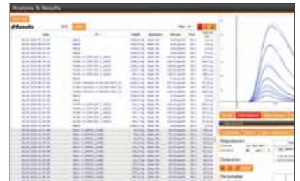
Analysis results after 120-180 seconds